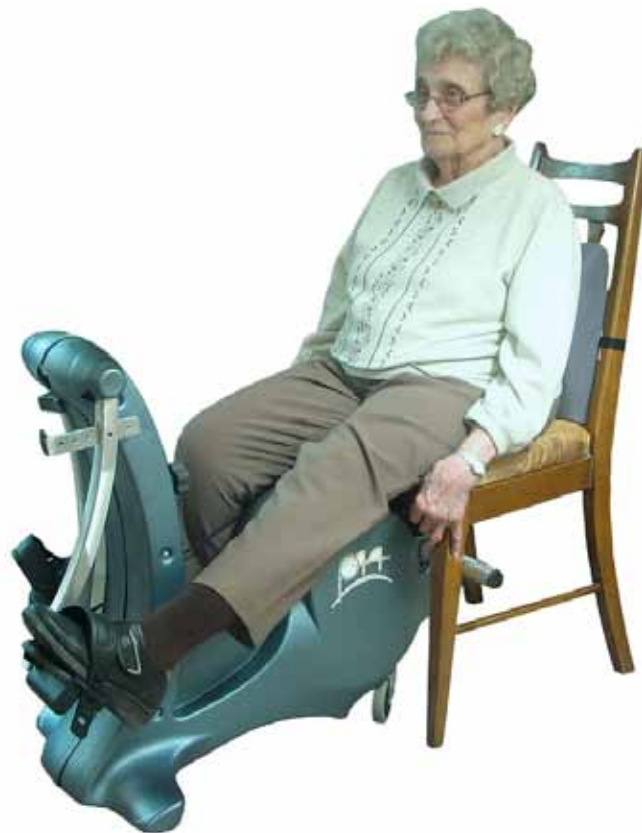
P44 Chair-Mounted Stepper